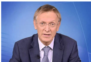
Janez Potočnik, EU Commissioner for Environment