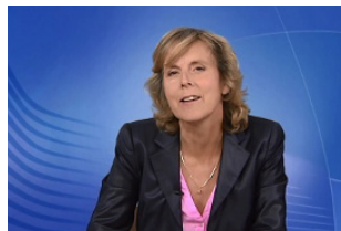
Connie Hedegaard, EU Commissioner for Climate Action