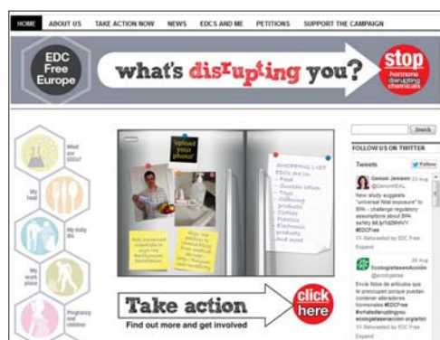
EDC-Free campaign website

vulnerability of developing children to environmental chemical exposure.