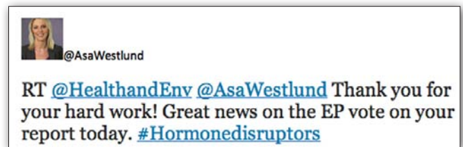
retweeted by MEP Asa Westlund

HEAL secretariat published articles in prestigious journals: • Early-life prevention of non-communicable diseases, The Lancet, 5 January 2013