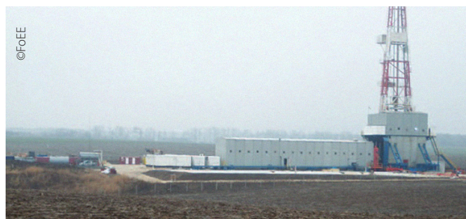
Shale drilling pad in Bulgaria.

calling on EU member states to suspend existing fracking projects and ban new ones. HEAL also provides a platform for exchange for grassroots and national groups, for science and policy development sharing.