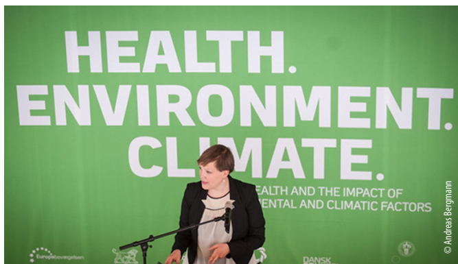
Danish health minister Astrid Krag gave examples why tackling climate change will benefit our health.

The Doha declaration will be used as an advocacy and organising tool within health and medical organisations at national, regional and global level to encourage more urgent and ambitious action on climate change.